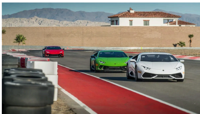
One of the possible Elevated Excursions is a day racing Lamborghinis at The Thermal Club track in la... [+]